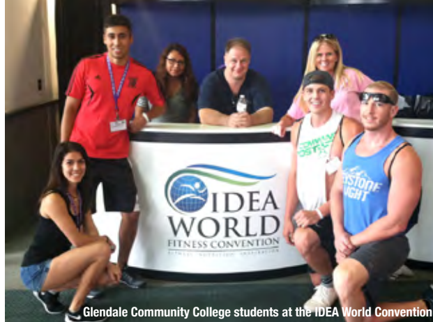
Glendale Community College students at the IDEA World Convention

With the IDEA World Discovery College Program, educators can beef up curriculum with new programming ideas and students can get insider insight into fitness as a career. Learn how to develop a college course for your students to attend the IDEA World Convention, while earning valuable college credit.